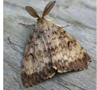
Beech Leaf Miner