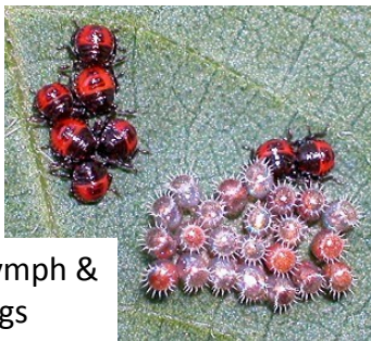
Nymph & Eggs

Spined Soldier Bug (from the family of stinkbugs but this variety does not feed on plants). Predators of the larvae stages of Gypsy Moth, Cabbage Looper, Colorado Potato Beetle, Mexican Bean Beetle and many other beetle larvae.