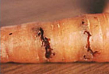
Carrot Rust Fly