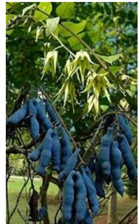
Blue Sausage Fruit