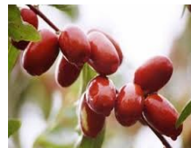
Fruits from left: Persimmon, Pomegranate and Jujube Fruit