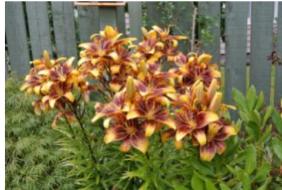
Vibrant lilies in Lyle and Sally Markham's garden