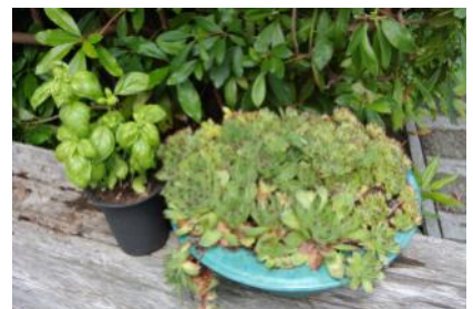
Beautiful succulents in Sally & Lyall Markham's garden