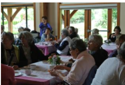
Visiting gardeners at Seaside Centre