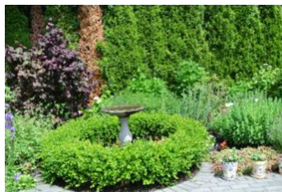
What bird wouldn't like Lorraine Gallant's fountain?