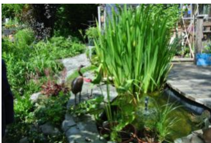
Ralph and June Meyer's water feature