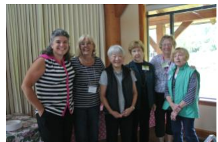
Our wonderful volunteers