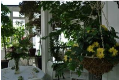
Stunning garden room at Sheila Armstrong Jones' cottage.