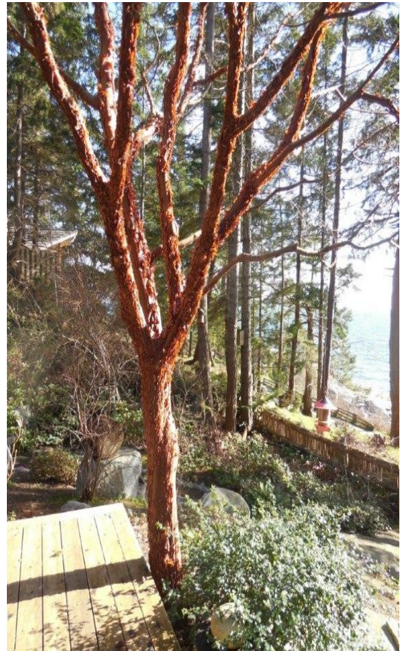
Beautiful paper-bark maple tree