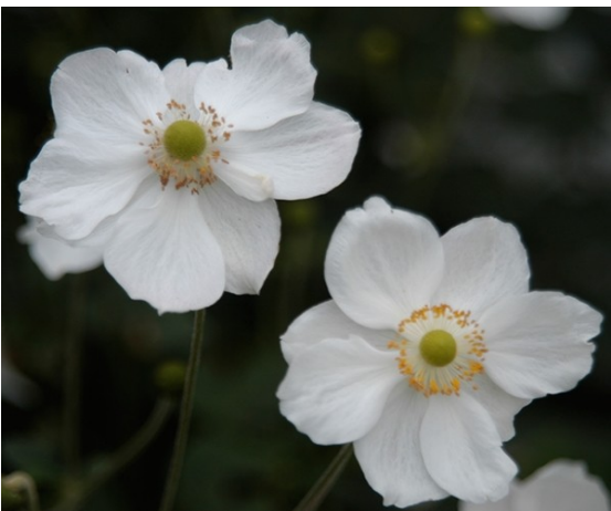
Honarine Jobert Japanese Anemone