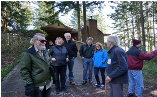
Cyclamen growing in the rocks .