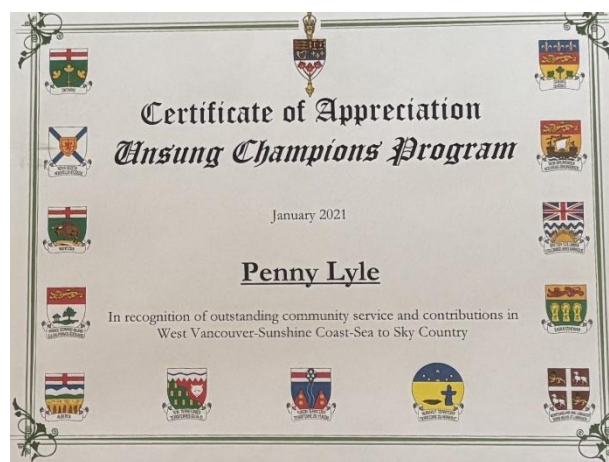
Certificate of Appreciation to Penny Lyle