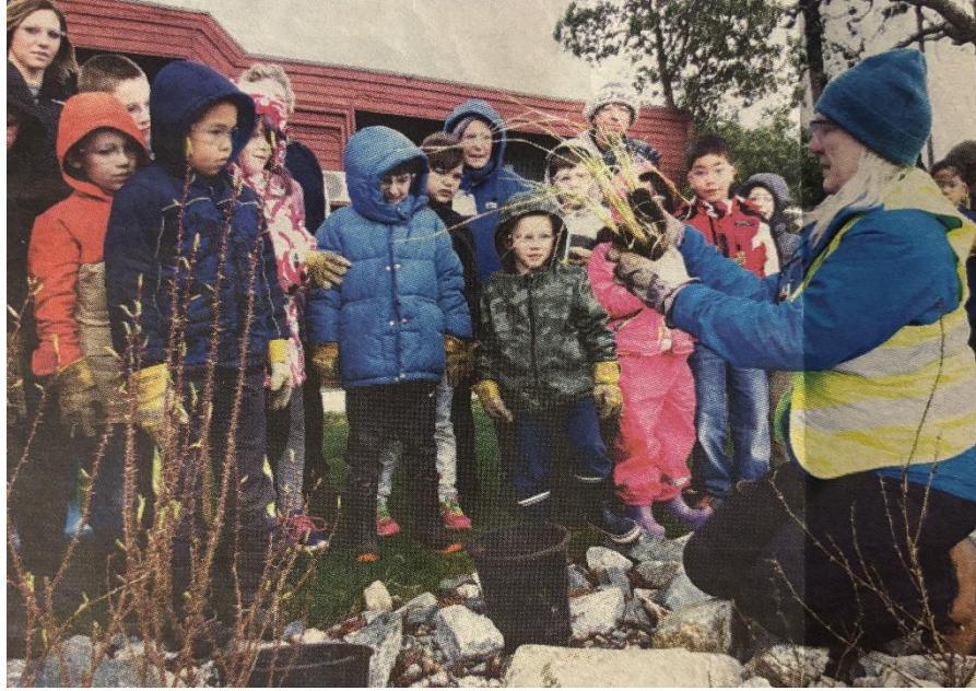
Kinnikinnik Elementary grades 2 and 3 students planted Nootka roses and dune grass along the rock wall outside the Watermark building in Sechelt on March 2, 2016.